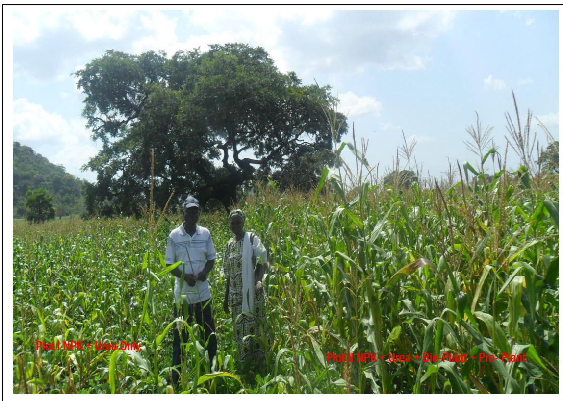
THE PROGRAMME MANAGER AND THE SASAKAWA GLOBAL 2000 COORDINATOR STANDING AT THE BORDER OF PLOT I AND II DURING THE FIELD-DAY