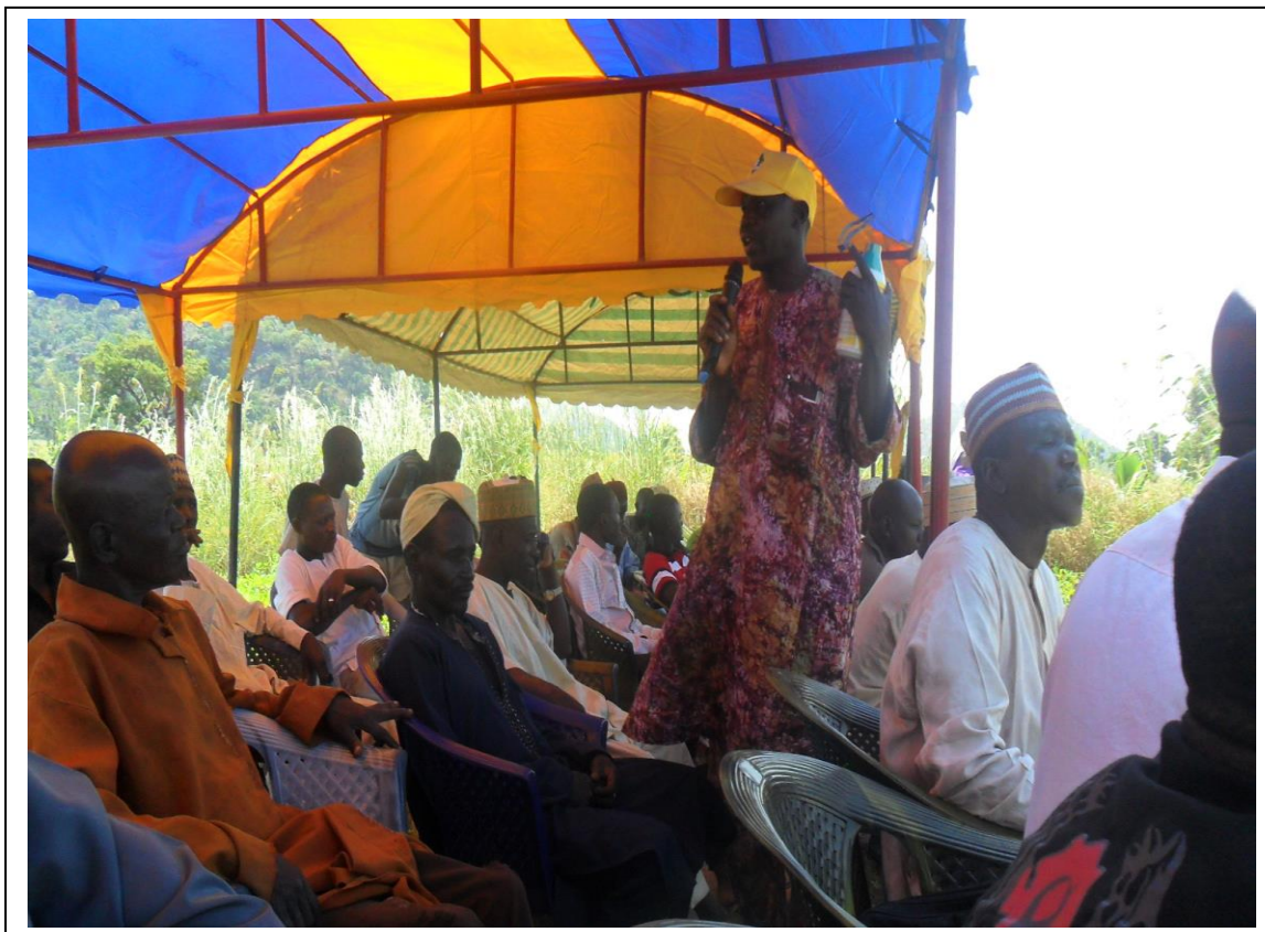
EXTENSION SUPERVISOR ANSWERING FARMERS QUESTIONS DURING THE FIELD-DAY