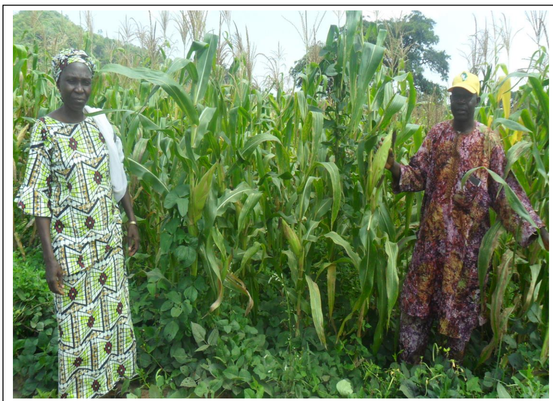
THE PROGRAMME MANAGER OF THE ADP AND AN EXTENSION STAFF DURING A SUPERVISION VISIT OF THE DEMONSTRATION PLOT

Below are some pictures taken from the plots.