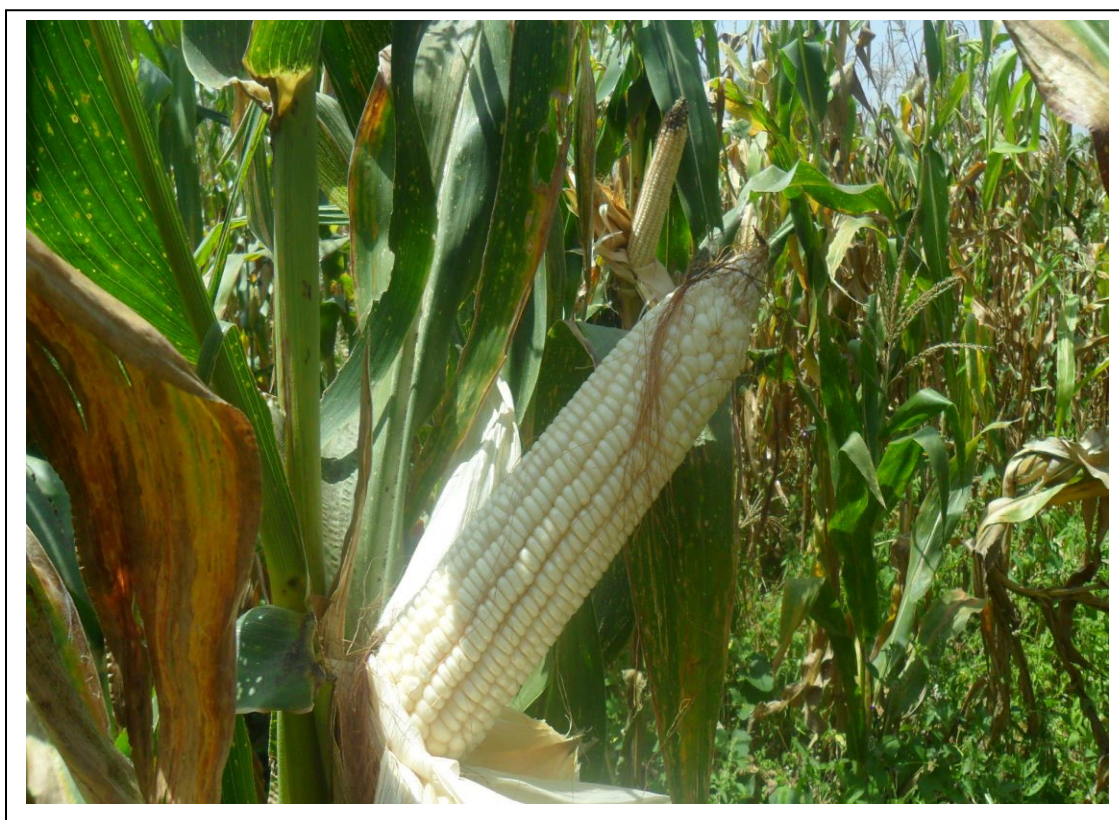
A MATURE COB ON PLOT I WITH STEM AND LEAVES STILL GREEN