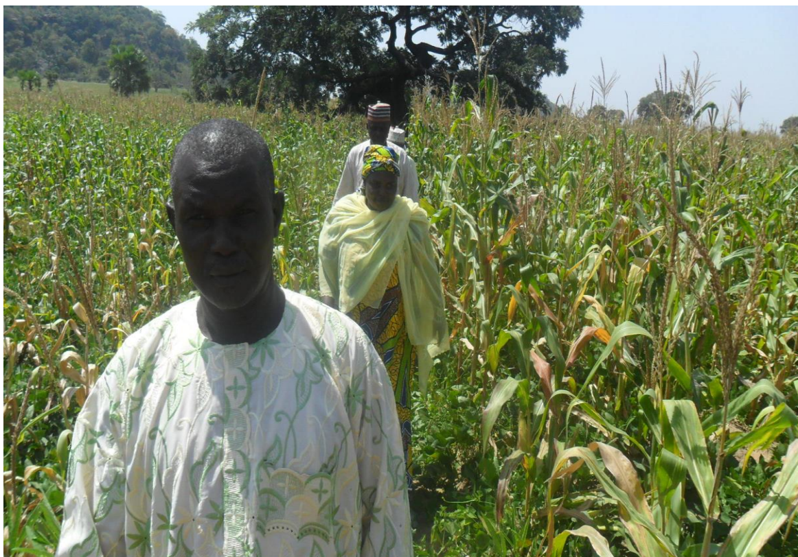
PARTICIPANTS AT THE FIELD-DAY GOING ROUND THE DEMONSTRATION PLOT (AT THE BORDER OF PLOT I AND II)