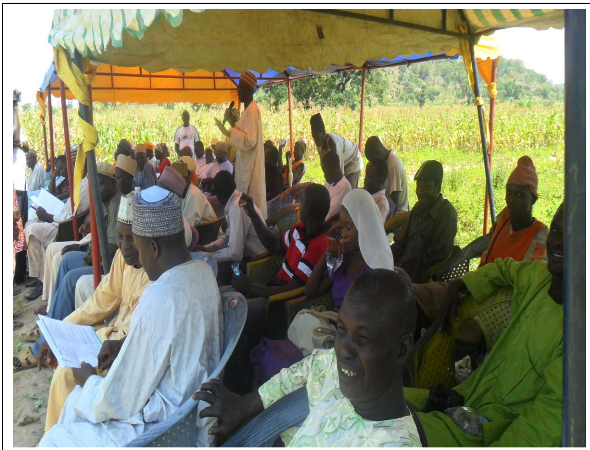
FARMERS ASKING QUESTIONS DURING THE FIELD-DAY