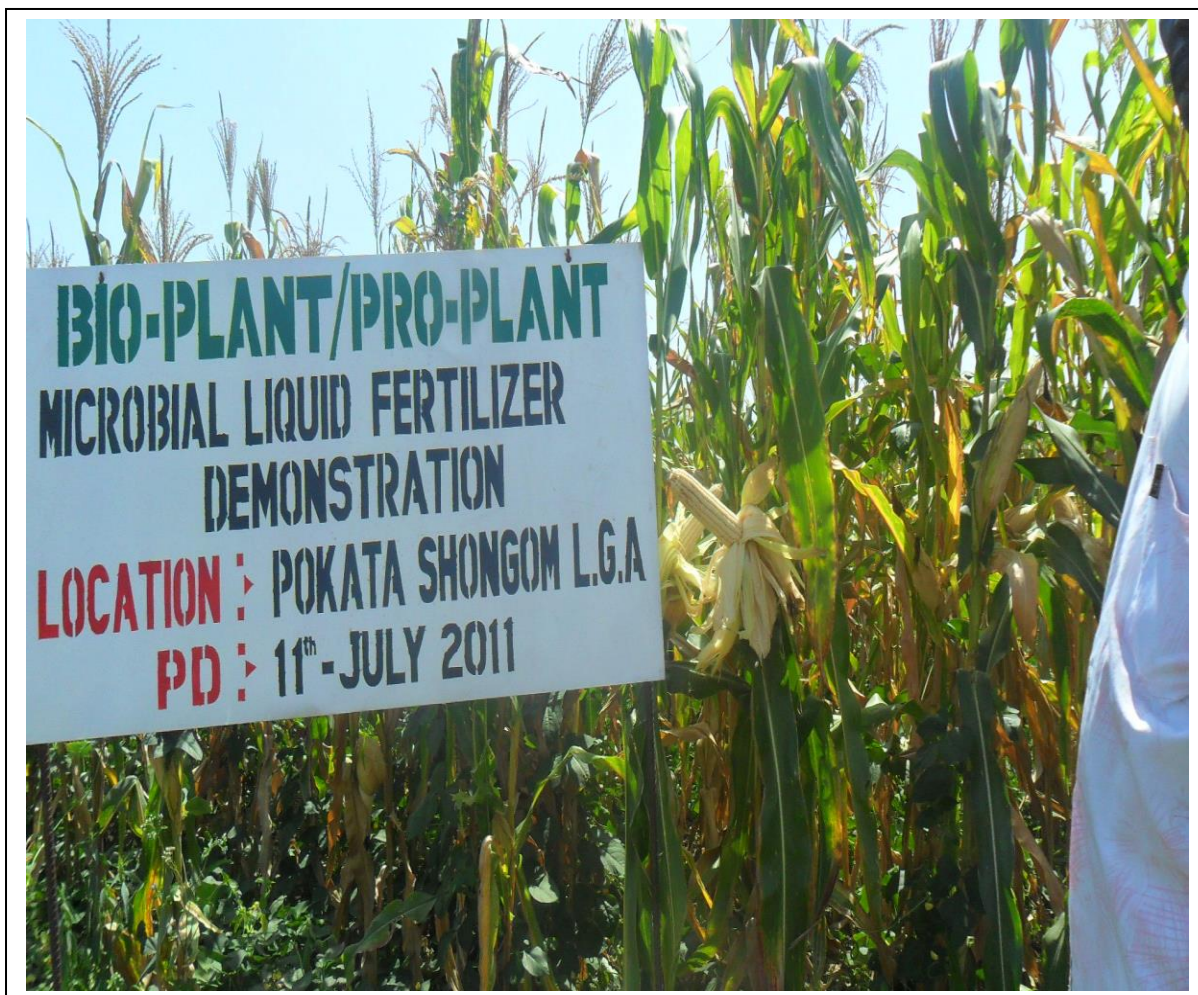
A PLOT LEVEL ON ONE OF THE DEMONSTRATION PLOT AT POKATA