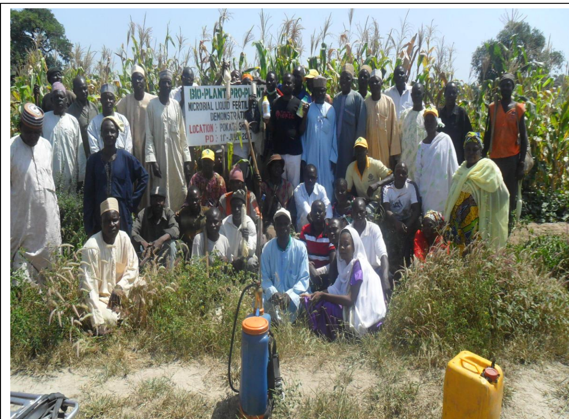
GROUP PHOTOGRAPH OF PARTICIPANTS DURING THE FIELD-DAY