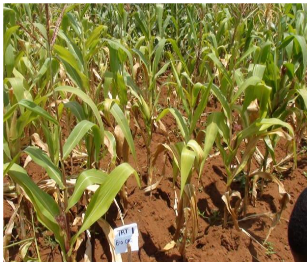
Trt 1 – Control: No fertilizer applied