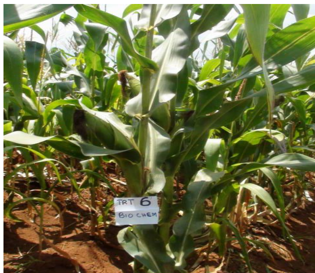
Trt 6 - Bio Plant + Pro Plant + ½ Rate Chemical Ferts