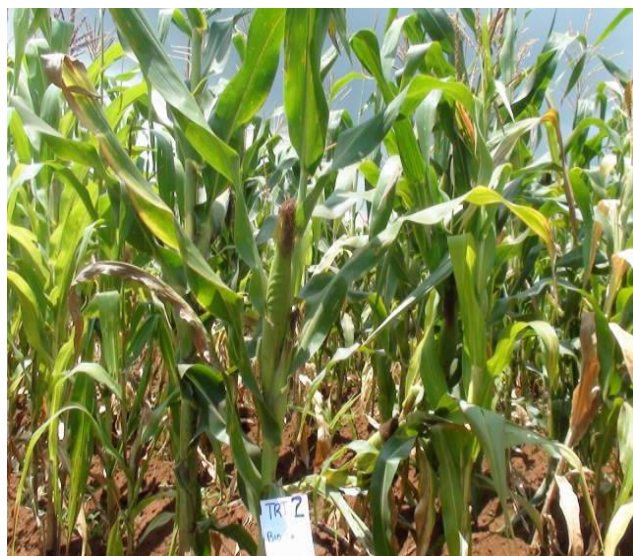
Trt 2 – Full Rate of Chemical Fertilizers only