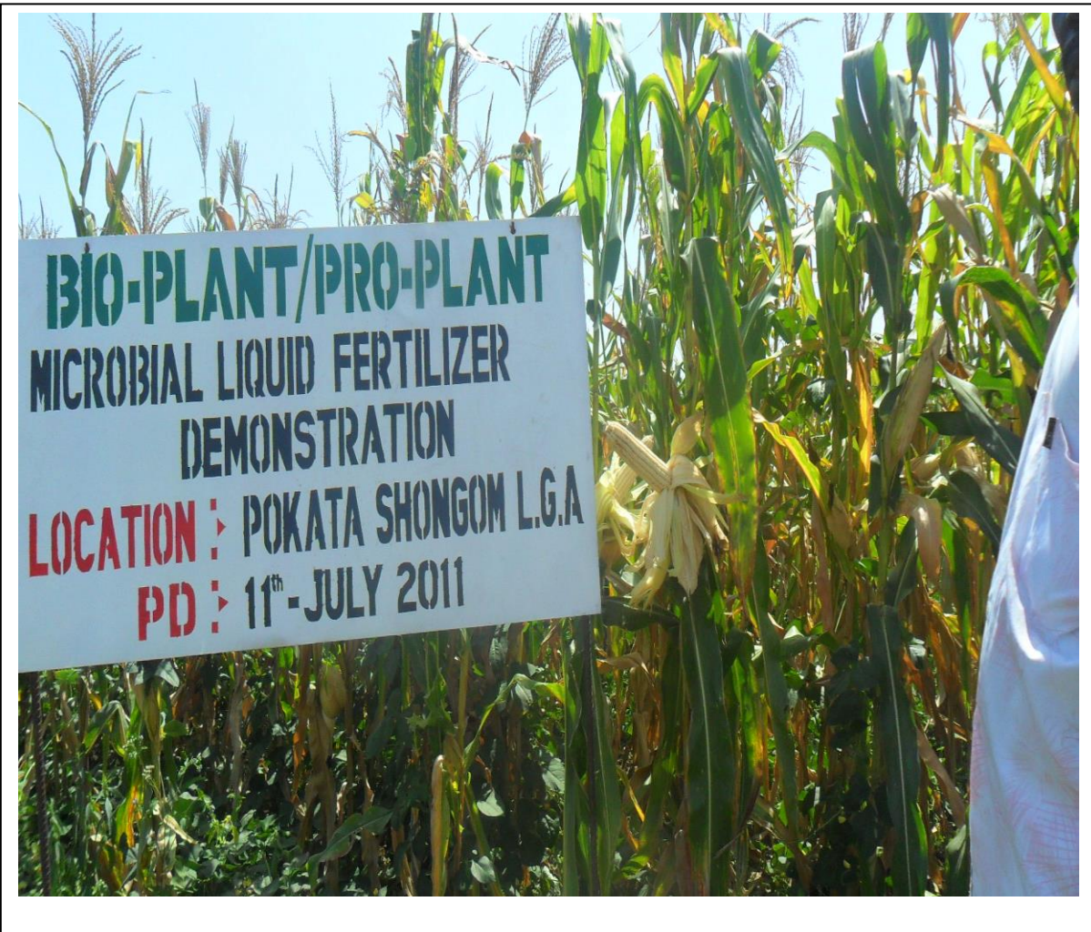
A PLOT LEVEL ON ONE OF THE DEMONSTRATION PLOT AT POKATA