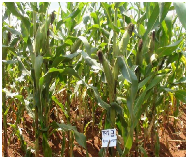
Trt 3 - ½ Rate Bio Plant + Pro Plant + Manure