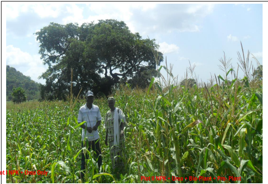
THE PROGRAMME MANAGER AND THE SASAKAWA GLOBAL 2000 COORDINATOR STANDING AT THE BORDER OF PLOT I AND II DURING THE FIELD-DAY