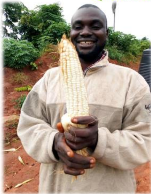
Maize from CO-GAED project farm, Ewu, Edo State where organic fertilizer was used.