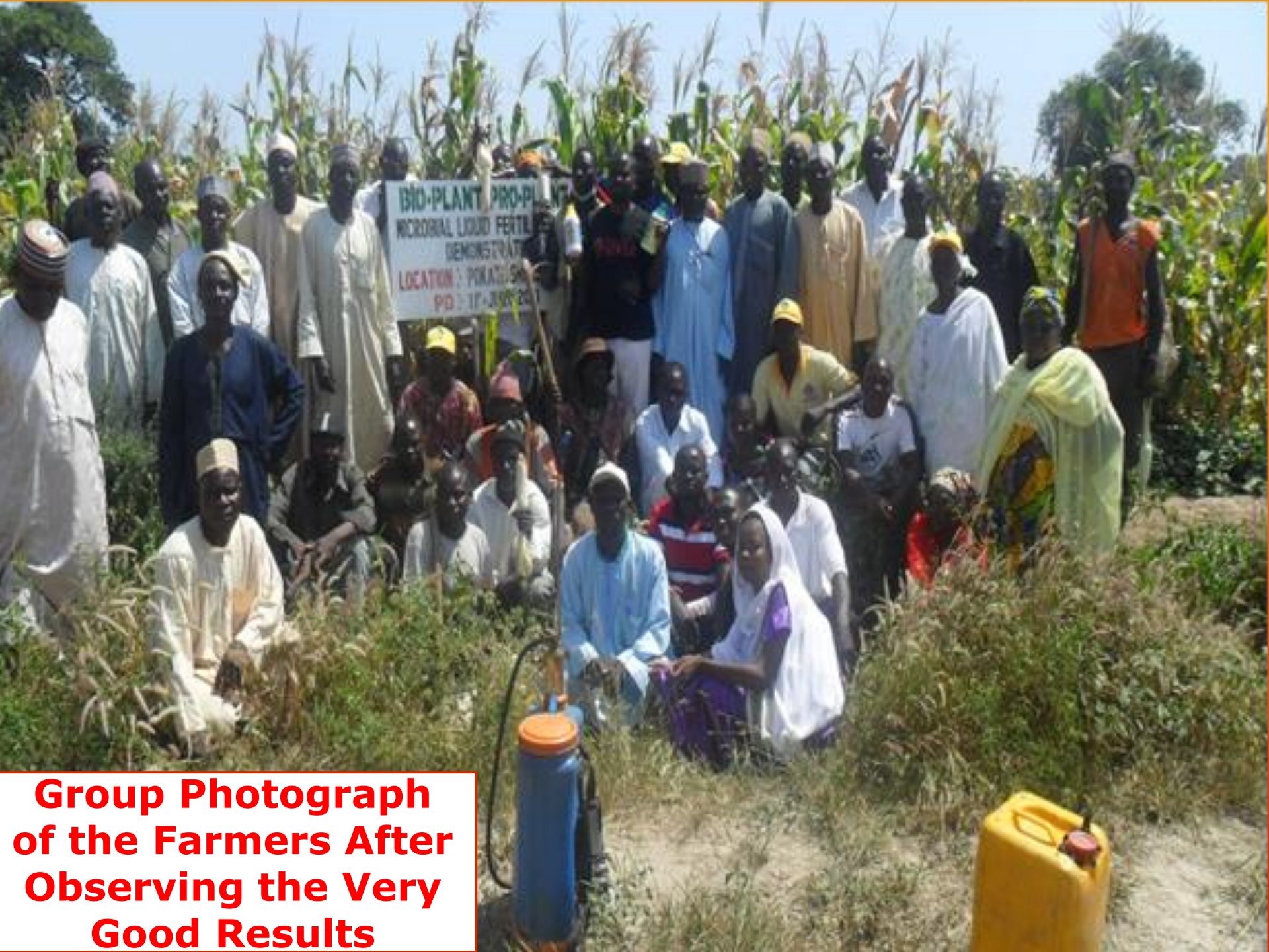
Group Photograph of the Farmers After Observing the Very Good Results