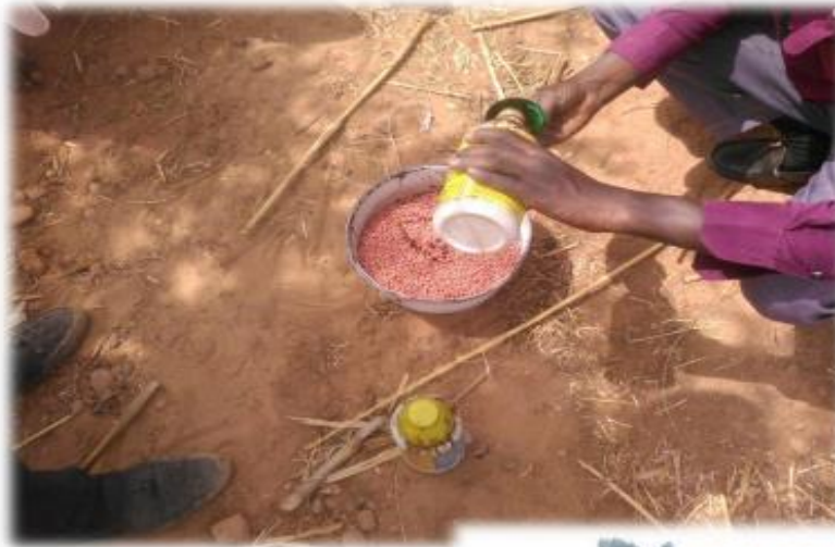
Katsina Farmer shown how to prepare seeds for planting using Salad Green Bio-Plant and Pro-Plant