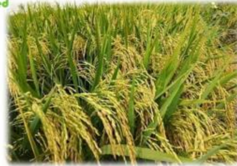
Salad Greenhouse rice farm at Lau, Taraba State with 95% seeds and a significant increase in soil fertility due to the use of Salad Green Bio-Plant and Pro-Plant .