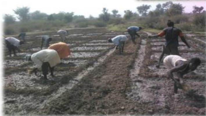
Katsina Farmers using Bio-Plant for Soil Preparation